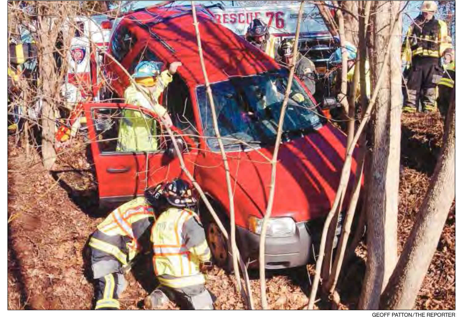
EMERGENCY RESPONDERS from Towamencin Fire Company and the Volunteer Medical Service Corps begin to remove an injured driver of an SUV lodged on an embankment a few feet from Towamencin Creek next to Kriebel Road in Towamencin. According to police, the female driver was northbound on Kriebel when for an unknown reason the vehicle left the roadway and struck trees on the east side of the road. The victim was transported from the scene by ambulance.