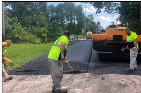
Public Works crew repaves Kriebel Road post-tropical storm

The Board recently granted final plan approval for three new businesses: Starbucks with a drive-thru, at the corner of Sumneytown Pike and Towamencin Avenue, adjacent to the Marriott; Manley Storage - an indoor-only 102,720 square feet storage facility, to be constructed on Franklin Street; and Core 5 - a warehouse facility consisting of three buildings, totaling 591,360 square feet, on Wambold Road near Allentown Road. All three developments are expected to be under construction by the