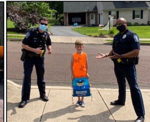
A birthday surprise provided by our officers

end of 2020. The Firestone Tire and Auto Service Center, adjacent to Freddy's Steakhouses and Frozen Custard, is under construction with completion expected later this year.