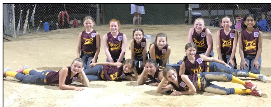
TYA District 22 10U Allstar Team

Saturday, June 4 - All Star Day & Home Run Derby