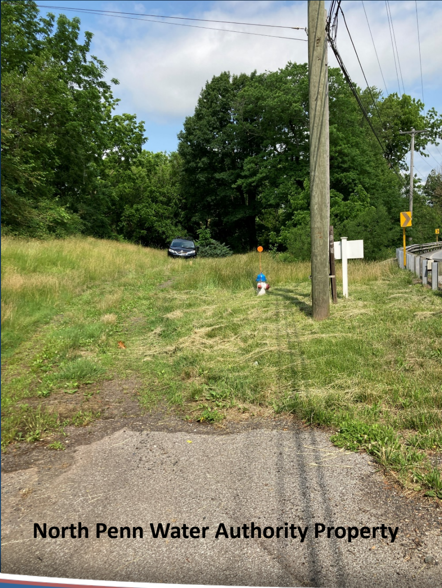
North Penn Water Authority Property