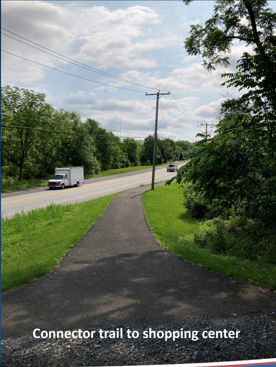
Connector trail to shopping center