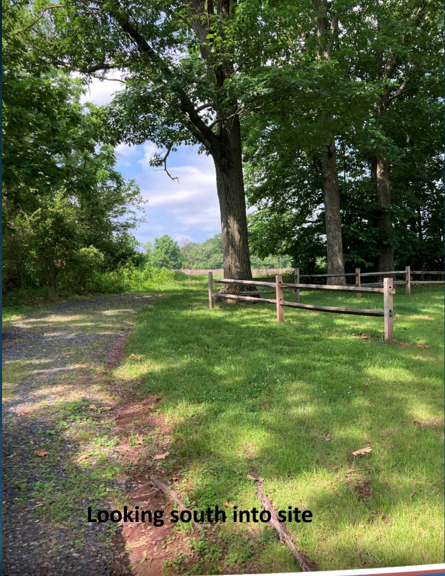
Looking south into site