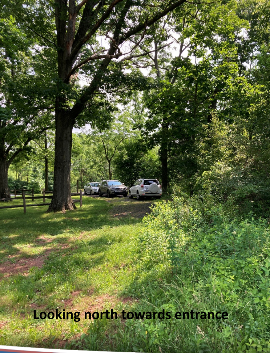
Looking north towards entrance