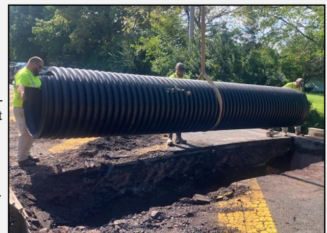
Public Works crew repairs sinkhole on Detwiler Rd. post Ida