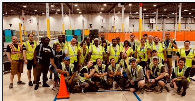
Amazon employees excited to launch delivery operations.

The Board Supervisors is pleased to report that Towamencin continues to move forward on numerous improvement projects to our parks, trails, traffic signals and roadways funded primarily by $3.4 million in awarded grants. We continue to see an up-tick in economic development activity with several new businesses in various stages of locating to the Township.