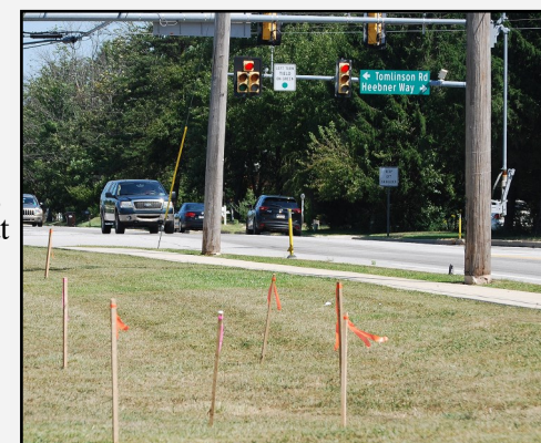
Stakes placed along Forty Foot Road, prepping for the widening project.