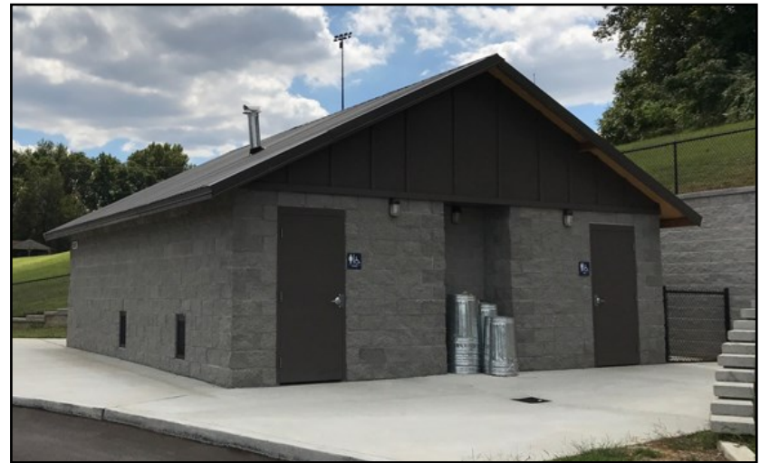
The new bathroom facilities will resemble the building above.

The Grist Mill facility (530 sq ft) will be slightly larger than the Green Lane's facility (380 sq ft) to accommodate the greater number of soccer players and parents attending games and practices at the multiple fields of this location. The facilities will be durable, tan colored cement block structures with long lasting metal roofs. Both will have separate restroom facilities for women and men, with multiple stalls.